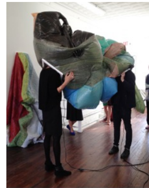
Interface by Dan Steinhilber.